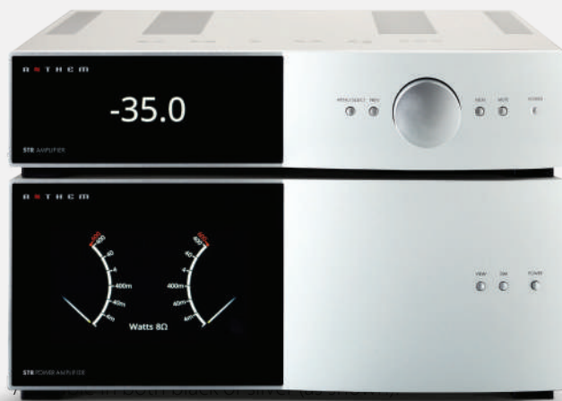
STR Power Amplifier pictured with STR Preamplifier (sold separately). Both models available in black or silver finishes.