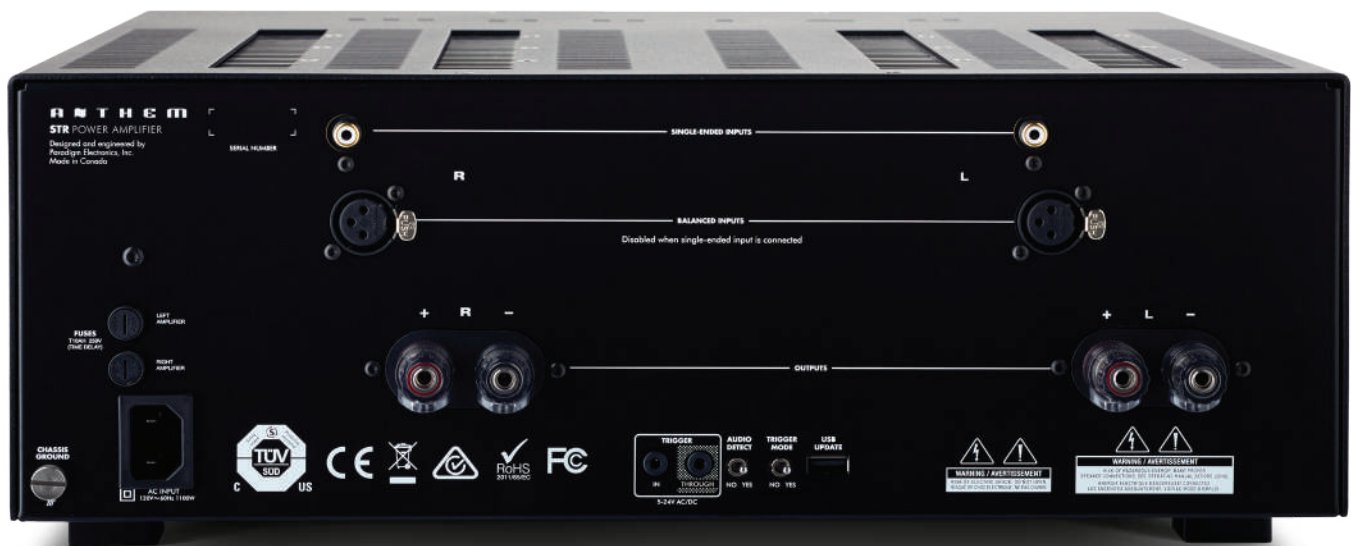
STR Power Amplifier Rear Panel